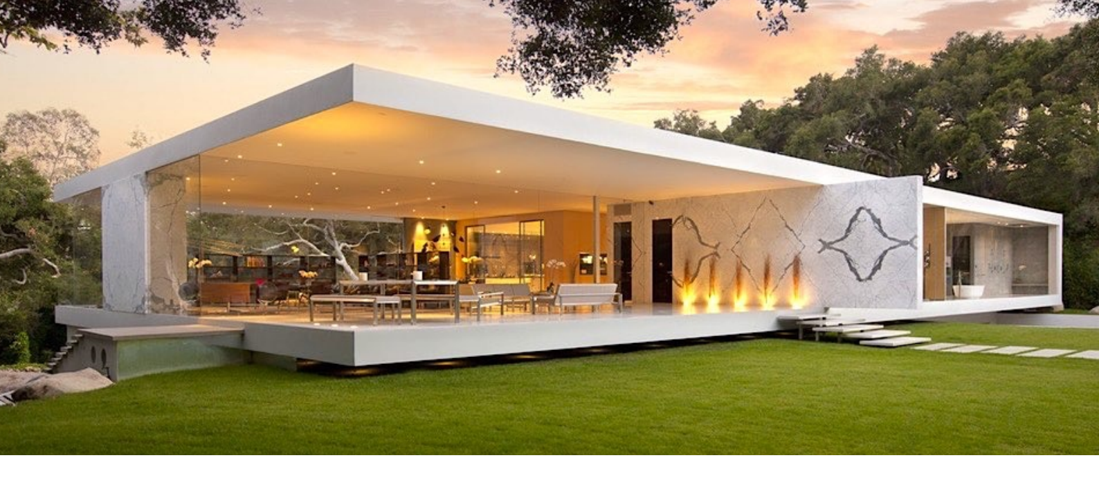
"Reliability of manual switching and freedom of the internet. Oxygen makes your home intelligent and obedient"